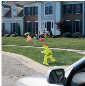
Photo of Step 2 Kid Alert