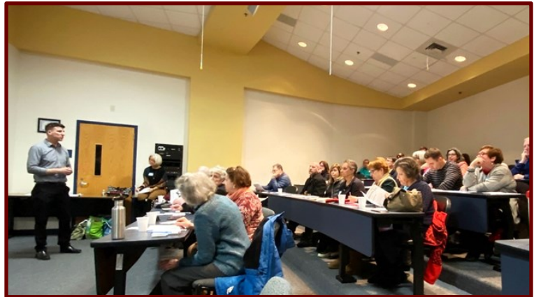
Town of Dedham / Livable Dedham December 2, 2019 Housing Study community meeting

The Town of Dedham, in collaboration with Livable Dedham, hosted a community meeting on December 2nd to discuss a joint housing study analyzing the Town's current housing stock, demands, supply, gaps and needs. Almost sixty attendees were offered a presentation and recommendations from housing study consultant JM Goldson. The attendees also discussed thoughts and ideas regarding the future of housing in Dedham. The joint study can be viewed and downloaded here: www.dedham-ma.gov/housing . Video of the meeting can be viewed here: Housing Forum