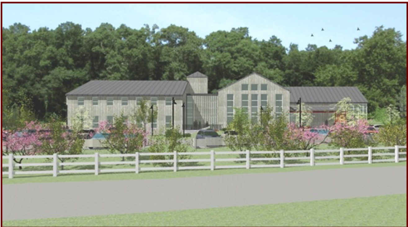
Proposed new Animal Rescue League Multi-use/Administrative Facility

B2 Tech LLC - 14,000 sq. ft. baseball batting cage/training facility at 110 Stergis Way