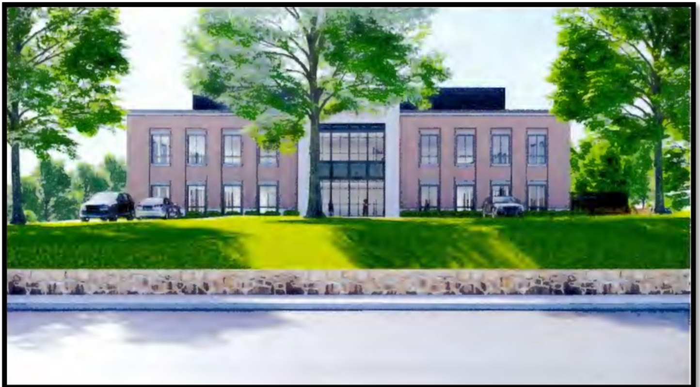
Proposed new Norfolk & Dedham Insurance Corporate Building