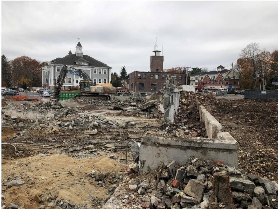
Cleanup and removal of slab on grade