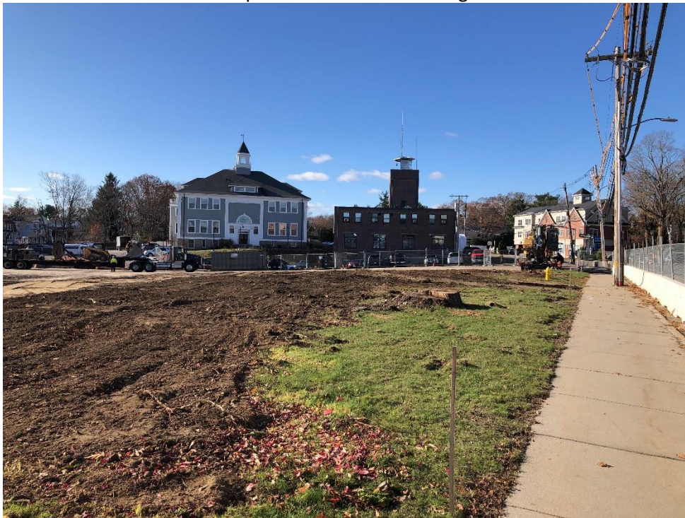
Demo completed and site ready for construction on 11/27/20.