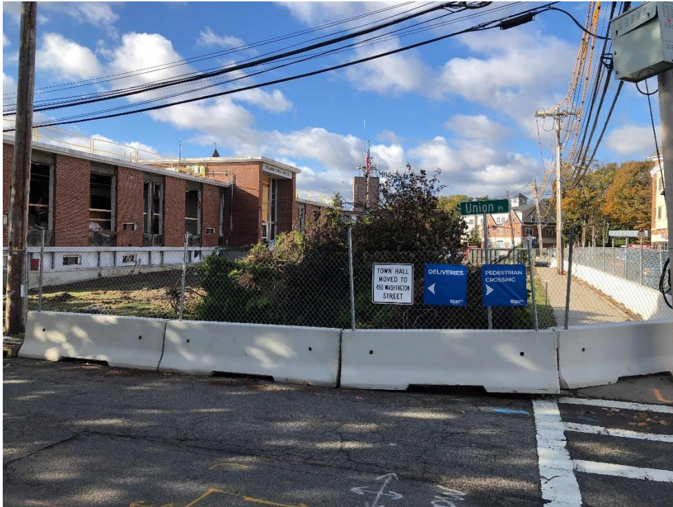
Building ready for demolition on 11/4/20.