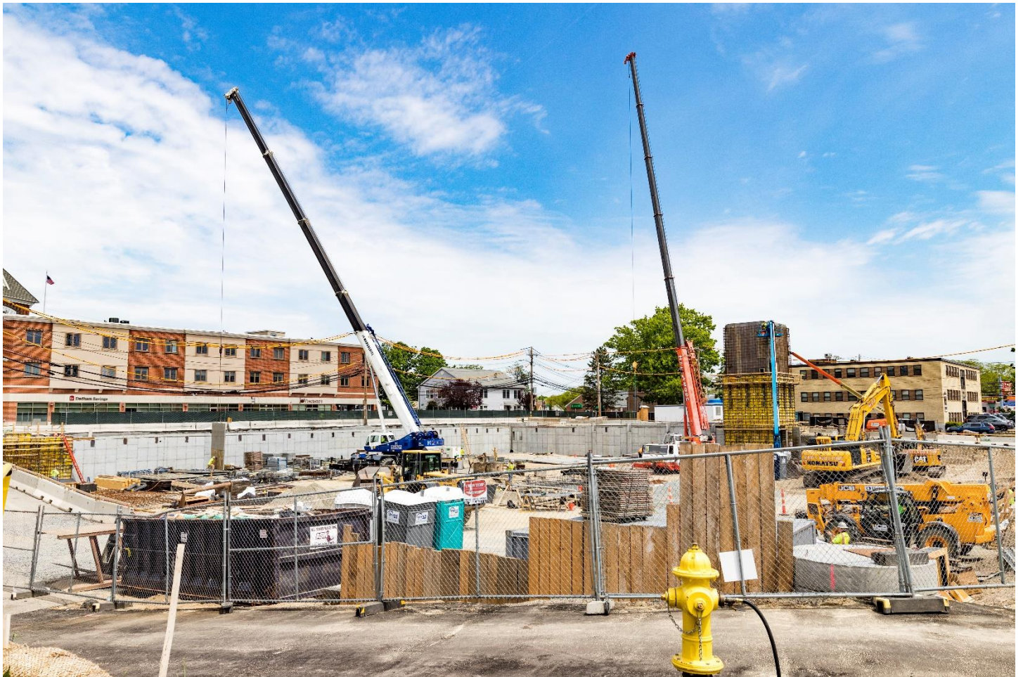
Caption: Photo of active construction site taken on Friday, May 21, 2021 by the Town of Dedham. Shown in the photo are two cranes currently in use by the construction team, and the shear walls of stairwell #2 (to the right).

Weekly Project Updates and 7-Day Look-Ahead