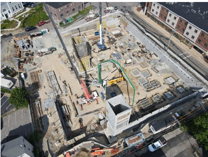
Caption: Aerial image of site, facing south/southwest, taken on Tuesday, June 8, 2021. The form for stairwell #2 at the bottom of the image has been removed and the shear walls have been completed.

Note: To subscribe to the Public Safety Building Project e-mail notifications, click here to provide your name and email address.