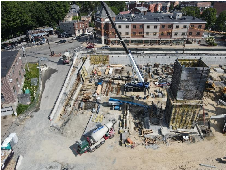
Caption: Aerial image of site, facing north to Bryant Street, taken on Tuesday, June 8, 2021. The shear walls for stairwell #1, shown to the right, are being formed with rebar and concrete.