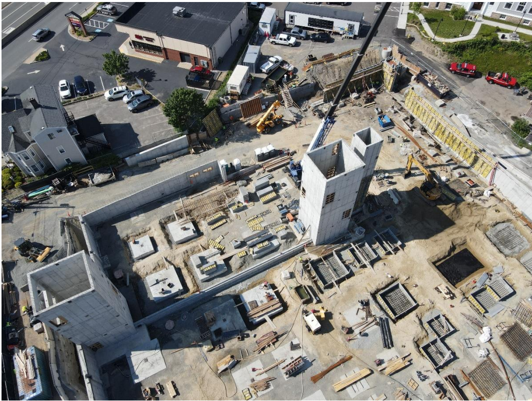
Caption: Aerial photo of construction site take on June 28, 2021. The concrete structures shown (3 in total) are the two stairwells and one elevator shaft.