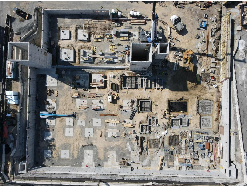
Caption: Aerial photo of construction site taken on June 28, 2021. The right of the photo shows the entrance to the site from the intersection at Washington Street and Bryant Street. The gray squares shown throughout the site are concrete foundation footings to support the structure. A total of 66 concrete footings will be installed upon completion.

Note: To subscribe to the Public Safety Building Project e-mail notifications, click here to provide your name and email address.