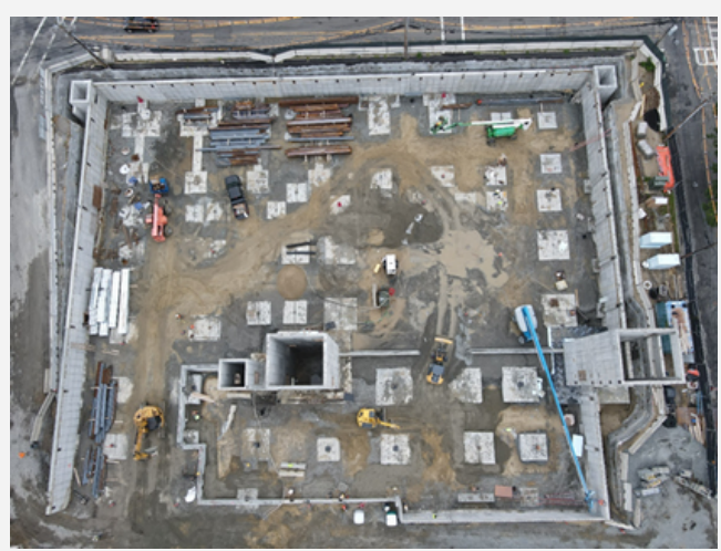
Caption: Aerial photo of construction site taken directly above on July 13, 2021. Pieces of steel are being delivered to the site and securely stored along the west and south walls, shown at the top and left of this photo.