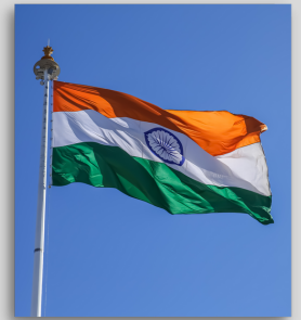
National Flag of India

So, look out for details on events in or near your town and the grand finale and come join the festivity as we honor India's 75th Independence Day celebration with style, pride and vigor!