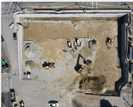
Before (photo taken April 9, 2021) - Click on the image to enlarge

For more information and to sign up for weekly construction updates, visit the Public Safety Building Project page .