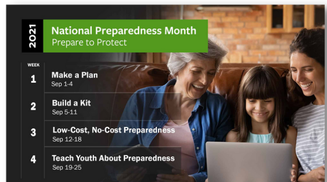
2021 National Preparedness Month Weekly Themes

From Ready.Gov : National Preparedness Month (NPM) is an observance each September to raise awareness about the importance of preparing for disasters and emergencies that could happen at any time. The 2021 theme is " Prepare to Protect. Preparing for disasters is protecting everyone you love. " For more information, please visit the Ready.Gov website by clicking on the image to the right: