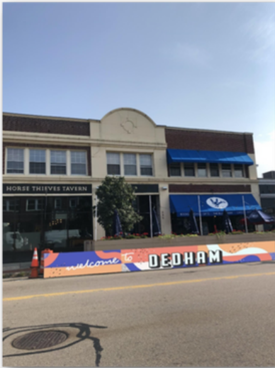
DEDHAM PUBLIC ART PROJECT BARRIER CONCEPT (CLICK ON IMAGE ABOVE TO ENLARGE)