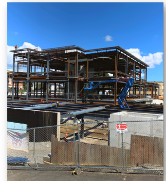
IMAGE TAKEN ON FRIDAY, SEPTEMBER 3, 2021 FROM THE PUBLIC VIEW AREA OUTSIDE TOWN HALL

For more information and to sign up for weekly construction updates, visit the Public Safety Building Project page .