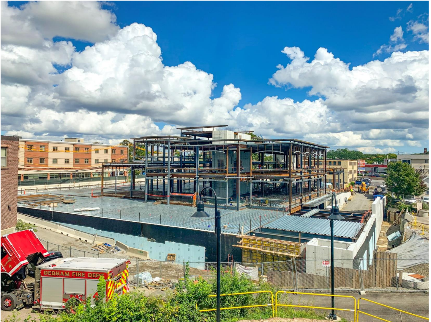
Caption: Photo of active construction site taken from the north side of Town Hall on Friday, September 10, 2021.

Note: To subscribe to the Public Safety Building Project e-mail notifications, click here to provide your name and email address.