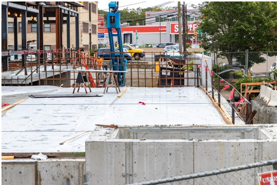
Caption: The southeast corner of the first floor concrete slab covered in hydracure blankets. The blankets are used as part of the wet curing process that trap moisture, such as rain, to assist in the curing process.