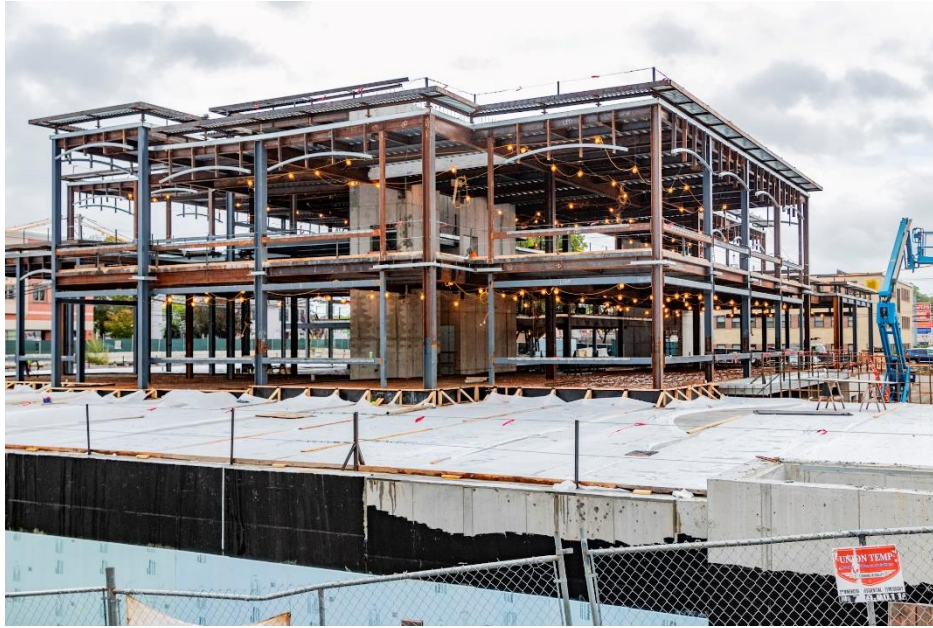
Caption: Photo of active construction site taken from the north side of Town Hall on Friday, September 24, 2021. The signed beam is still visible near the elevator shaft and stairwell at the center of the photo.