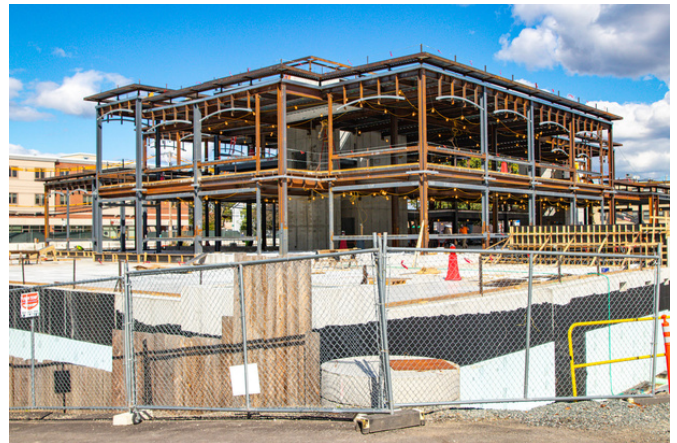
Caption: Photo of active construction site taken from the north side of Town Hall on Friday, October 1, 2021.