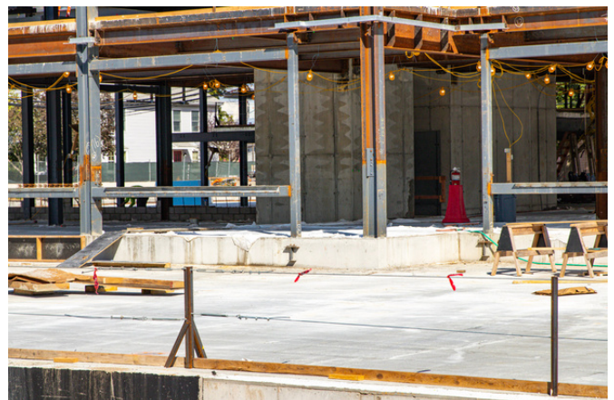
Caption: Photo taken on Friday, October 1, 2021 of a section of the concrete slab on the second floor.