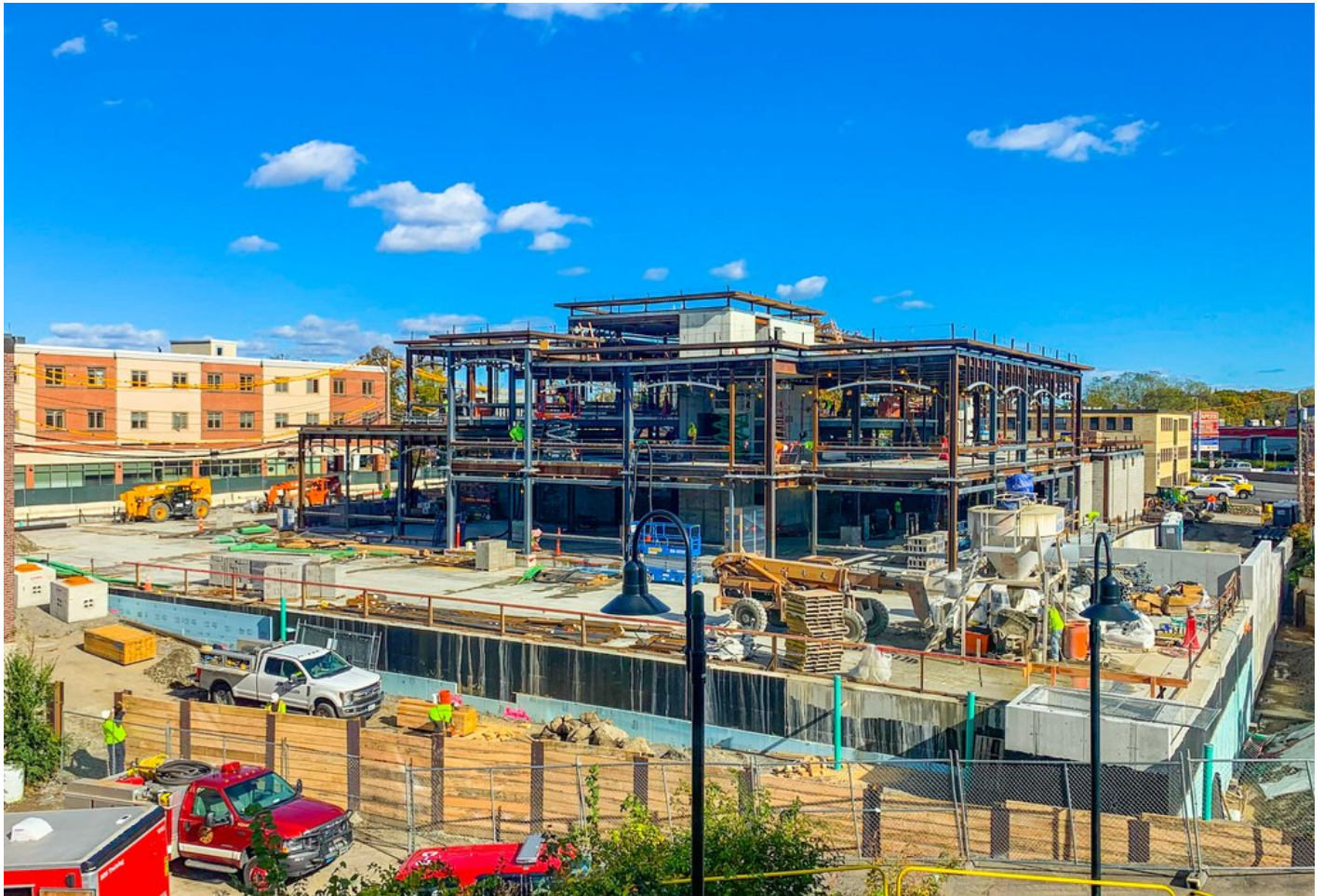
Caption: Photo of active construction site taken from the north side of Town Hall on Monday, November 1, 2021.