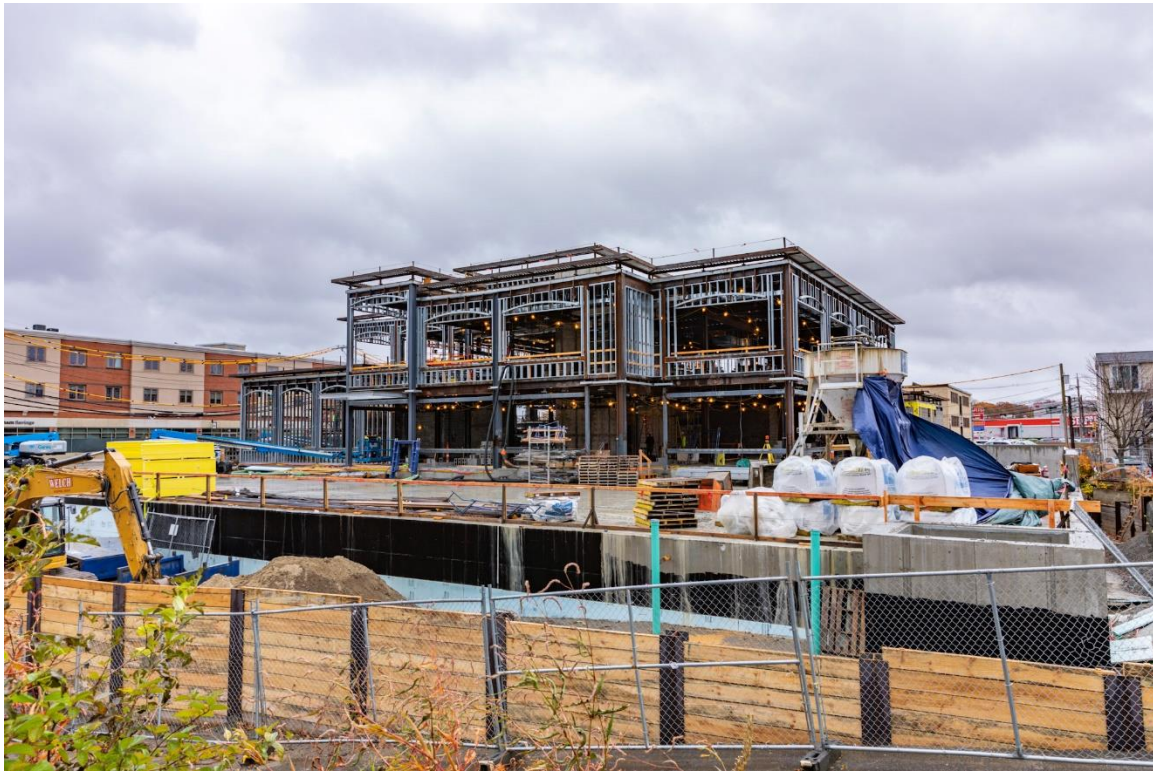
Caption: Photo of active construction site taken from the north side of Town Hall on Friday, November 12, 2021.