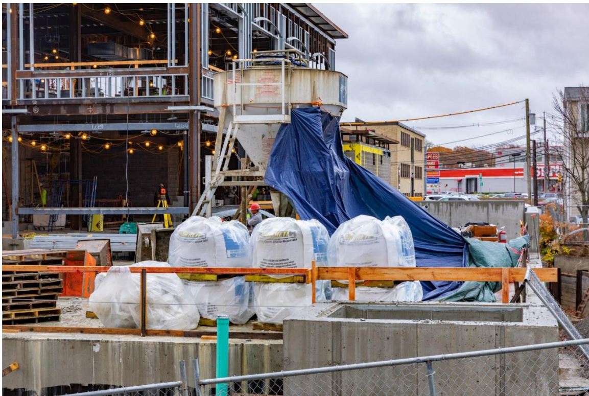
Caption: Photo of the southern corner of the active construction site taken from the north side of Town Hall on Friday, November 12, 2021. The large white bags shown at the center of the photo contain concrete mixture for mortar and grout.

Note: To subscribe to the Public Safety Building Project e-mail notifications, click here to provide your name and email address.