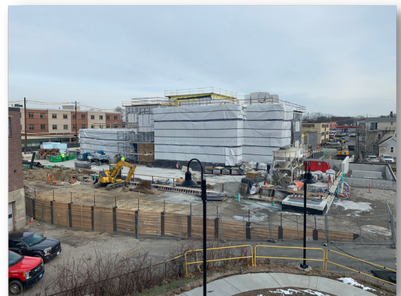
Caption: Photo of the active construction site taken from the north entrance to Town Hall on Friday, January 28, 2022.