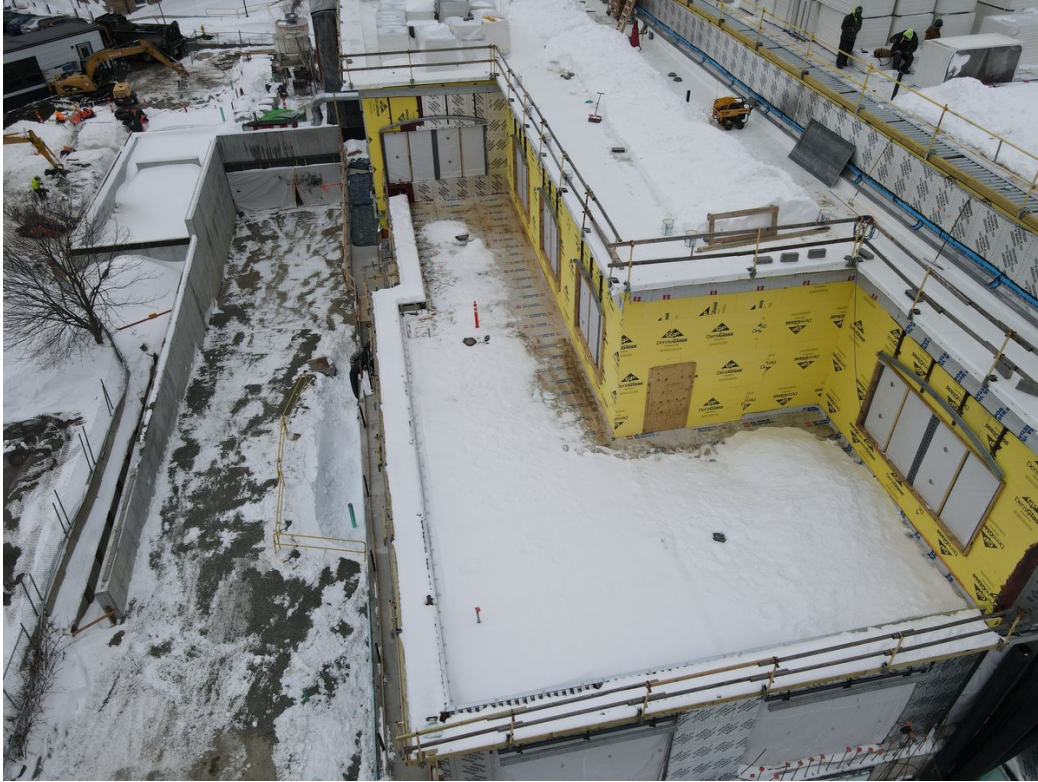
Caption: Photo of active construction site taken using drone on Tuesday, February 1, 2022. The yellow walls along the south side of the building are the Densglass sheathing. The air/vapor barriers will continue to be installed this week along the south side of the building.