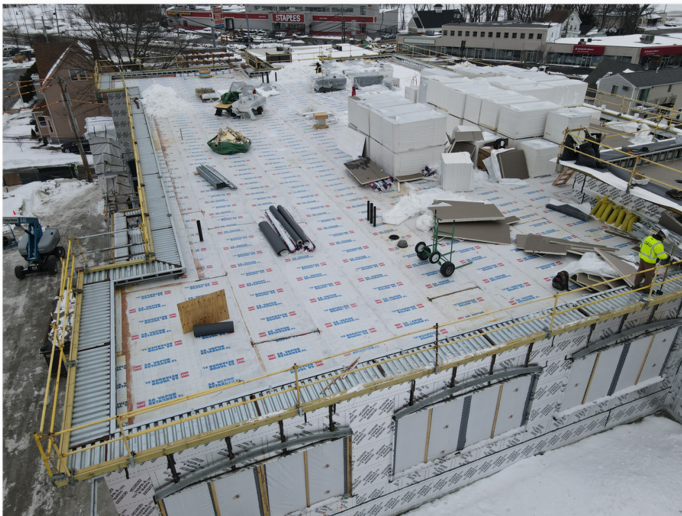
Caption: Photo of active construction site taken using drone on Tuesday, February 1, 2022. Roofing materials stored onsite (stacked white boxes to the right of the photo) will continue to be installed this week by roofing subcontractors.