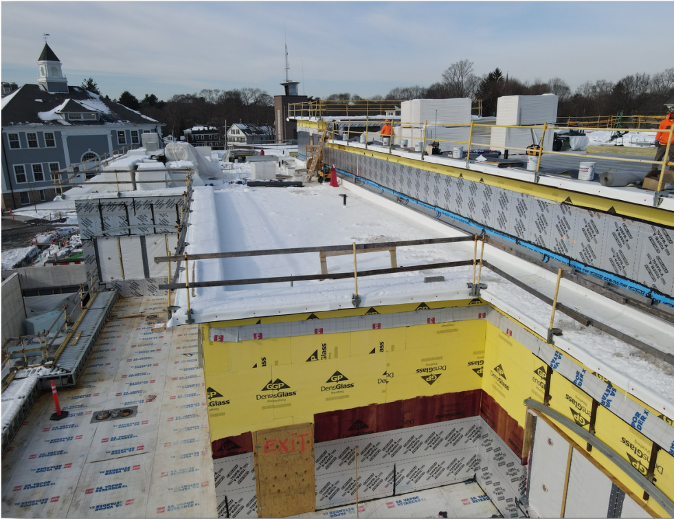
Caption: Photo of the roof installation underway taken using a drone on Wednesday, February 16, 2022.