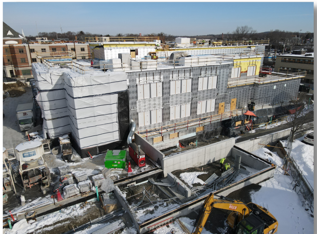
Caption: Aerial photo of the east side of the building using a drone on Wednesday, February 16, 2022.