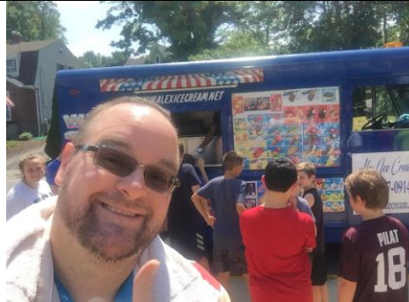
Launch students enjoying field day and a visit from the Ice Cream Truck!