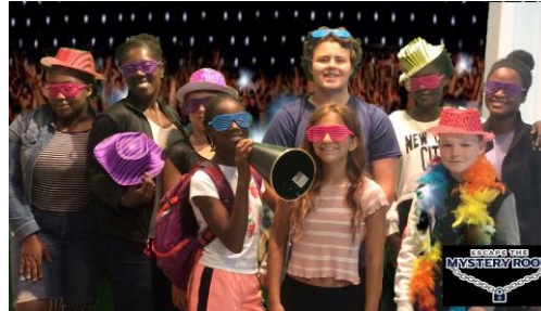
Launch students enjoying a trip to the Escape Room Boston