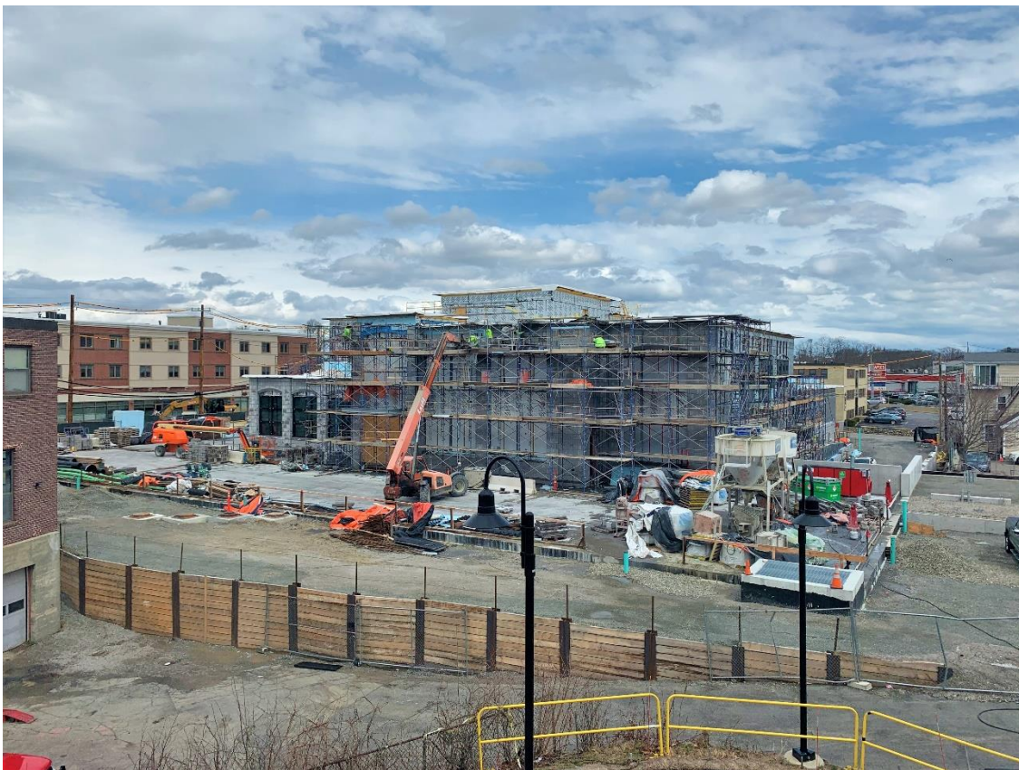
Caption: Photo of the active construction site taken from the north side of Town Hall on Friday, April 1, 2022.

Note: To subscribe to the Public Safety Building Project e-mail notifications, use this link to enter you email address, and select "Public Safety Building" from the list of options.