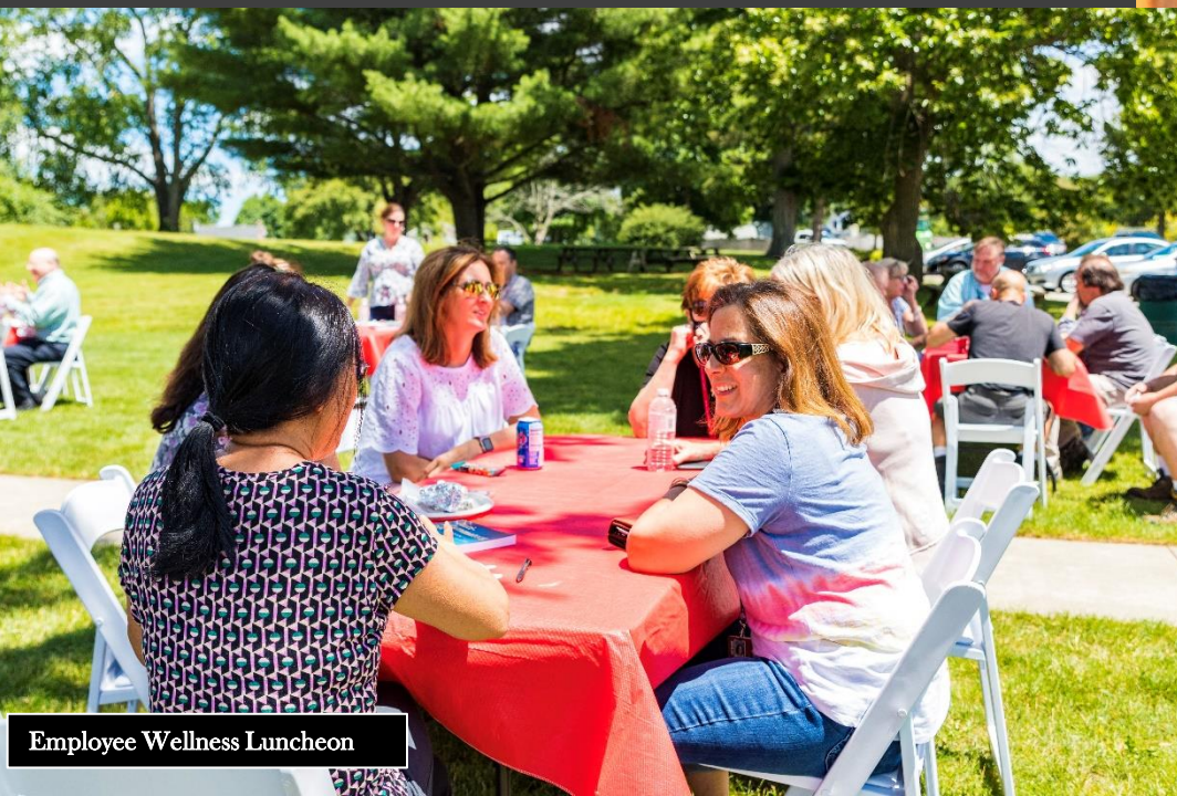
Employee Wellness Luncheon