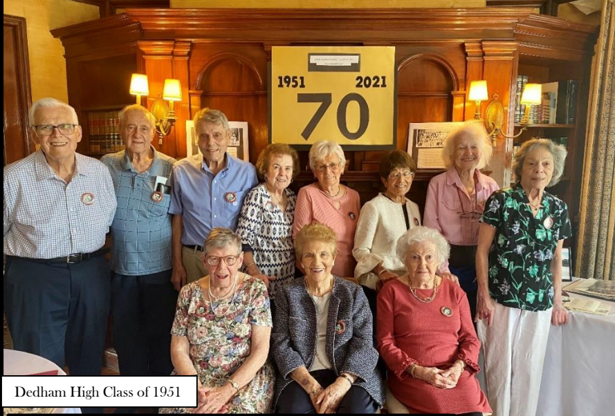
Dedham High Class of 1951