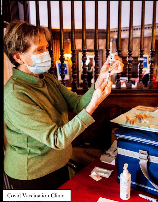
Covid Vaccination Clinic