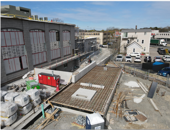
Caption: Photo of the active construction site and rebar for the transformer pad taken via drone on Thursday, April 28, 2022. Concrete was poured into place on the transformer pad on Monday, May 2, 2022.