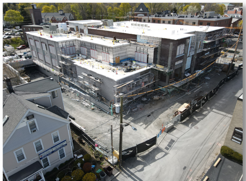
Caption: Photo of the active construction site taken via drone facing the north corner of the building on Thursday, April 28, 2022.