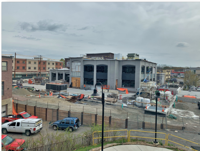
Caption: Photo of the active construction site taken from the north side of Town Hall on Friday, May 6, 2022.