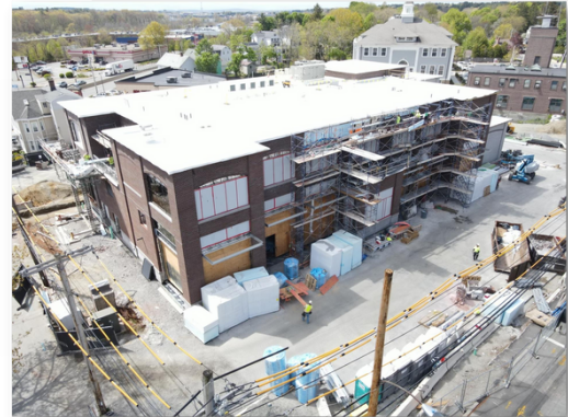
Caption: Photo of the exterior of the north side of the building, taken by done on Friday, May 13, 2022. The red brick veneer is being installed along the exterior of the Fire Station portion of the new building. The staging, as shown in this photo, will be removed as the exterior stonework is completed.