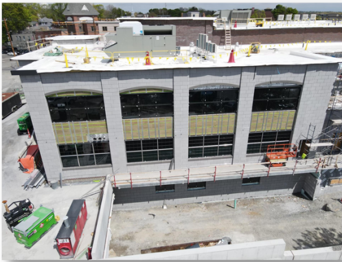
Caption: Photo of the exterior of the south/southeast side of the building, taken by done on Friday, May 13, 2022. The grey stone exterior, known as Shouldice, is being installed along the exterior of the Police Station portion of the new building. The staging, as shown to the right in this photo, will be removed as the exterior stonework is completed.