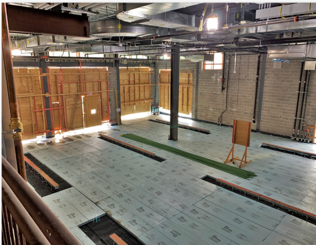
Caption: Photo overlooking the Fire Station maintenance bays taken from the mezzanine level as of Wednesday, May 18, 2022.