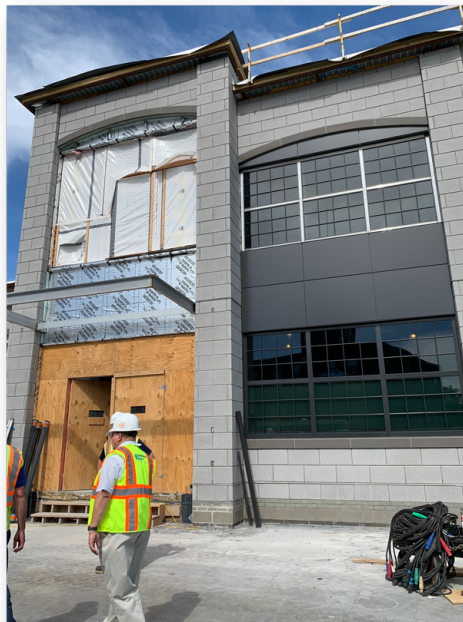
Caption: Photo of the exterior of the building at the public entrance to the Public Safety Building, currently covered in plywood, taken on May 18, 2022. Crews are continuing to work on framing and glazing of this and other entrances/exits.