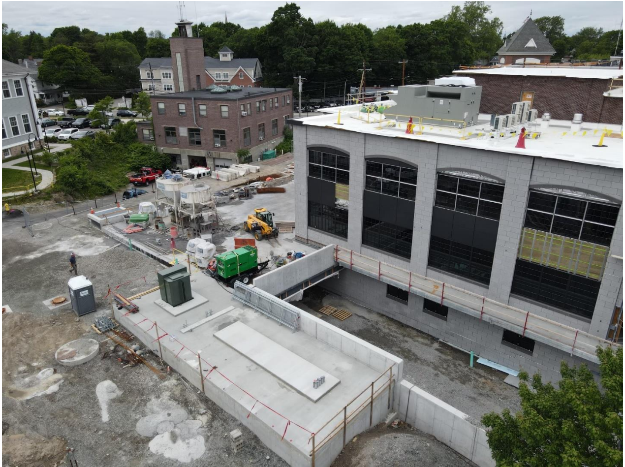
Caption: Photo taken on Wednesday, June 1, 2022 via drone overlooking the underground garage driveway entrance located along the south/southeast side of the building. To the left of the driveway entrance, at the bottom center of this photo, is the concrete pad for the generator that will be installed at a later date.

Note: To subscribe to the Public Safety Building Project e-mail notifications, use this link to enter you email address, and select “Public Safety Building” from the list of options.