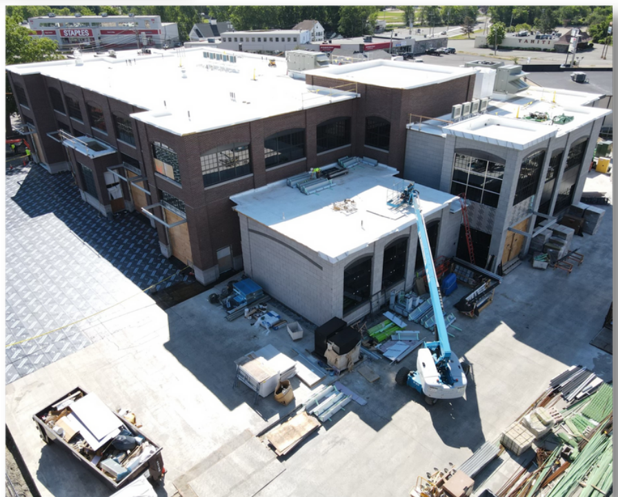
CAPTION: Photo of the active construction site on Tuesday, June 14, 2022 via drone facing east. The exterior stone and brick masonry work has been completed and contractors are shown to the center right of the photo loading materials to the roof via small crane and lift.