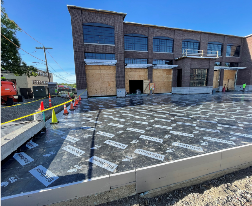
CAPTION: Photo of the front of the Fire Department taken on Tuesday, June 14, 2022. The black surface shown in front of the Fire Department is a waterproof membrane (Bituthene) designed to level and protect the subsurface.