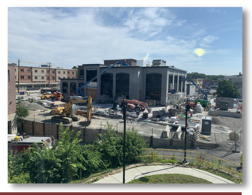
CAPTION: Photo of the active construction site taken from the north side of Town Hall on July 1, 2022.

CAPTION: Photo of crane lifting section of cell tower for installation within the site boundaries of the new Public Safety Building, take on Wednesday, June 29, 2022.