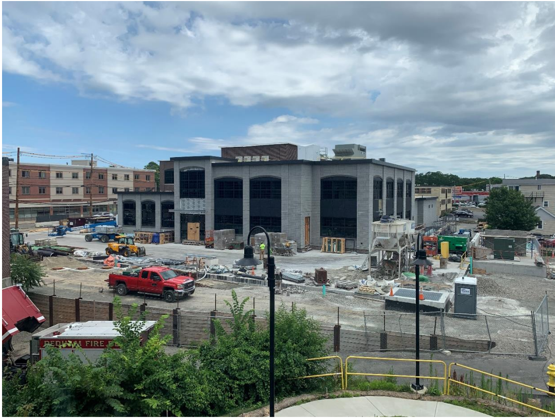
Caption: Photo of the active construction site taken from the north side of Town Hall on July 8, 2022.

Note: To subscribe to the Public Safety Building Project e-mail notifications, use this link to enter you email address, and select “Public Safety Building” from the list of options.