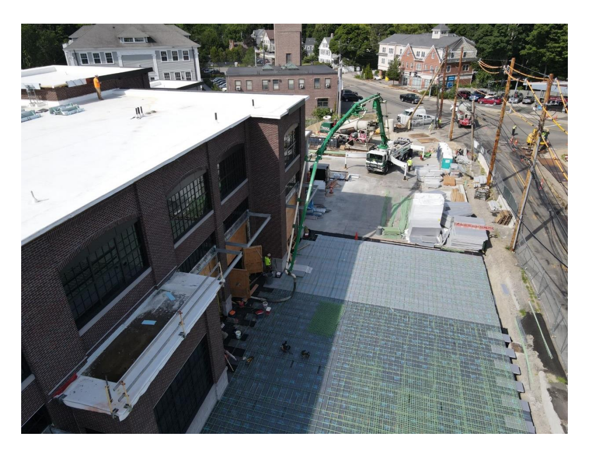
Caption: Photo of the new Fire Station Apparatus Bay entrance and driveway, taken via drone on Tuesday, July 26, 2022.