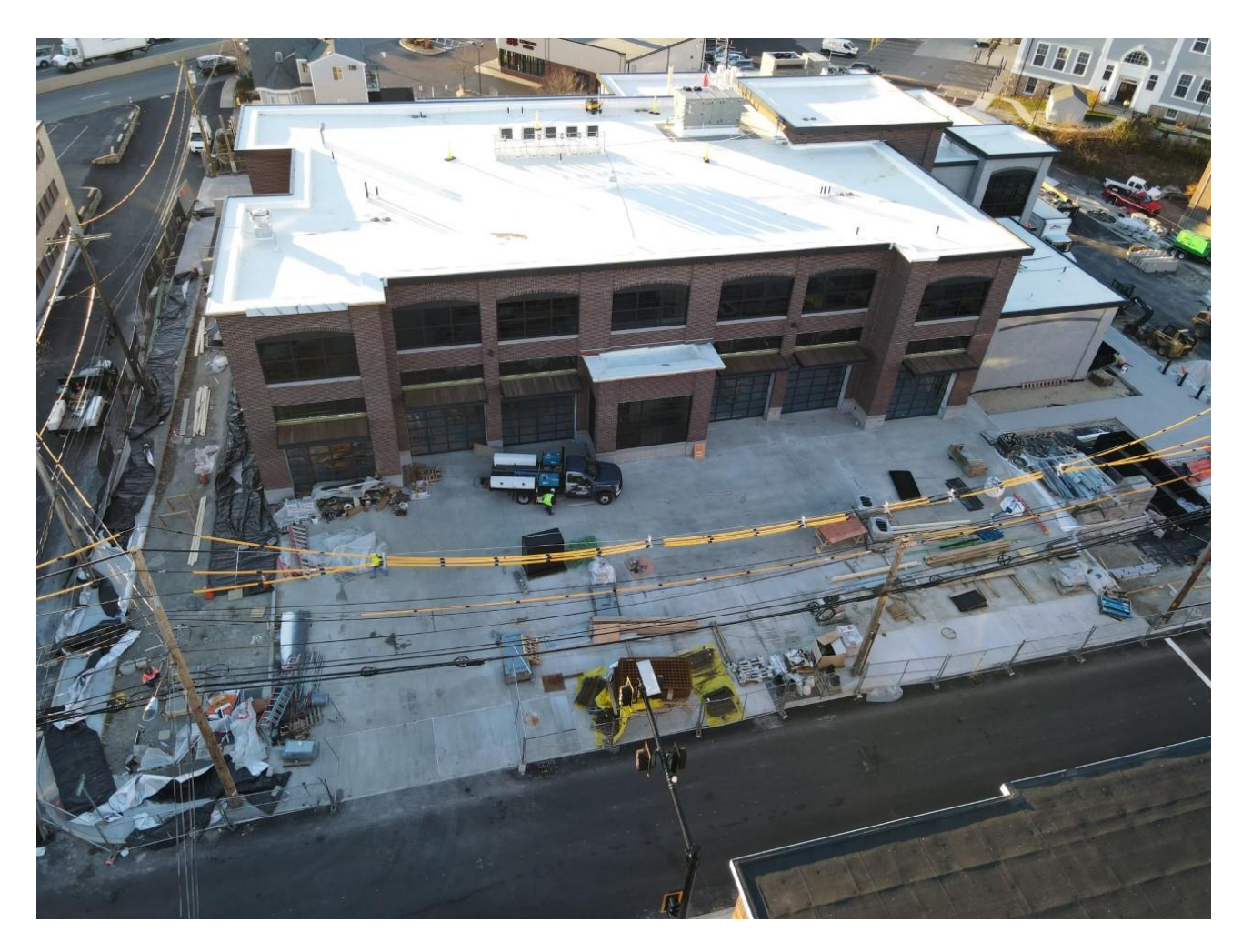
Caption: Photo of the active construction site via drone on Monday, November 21, 2022 facing the west side of the building along Bryant Street.

Note: To subscribe to the Public Safety Building Project e-mail notifications, <u>use this link</u> to enter you email address, and select "Public Safety Building" from the list of options.