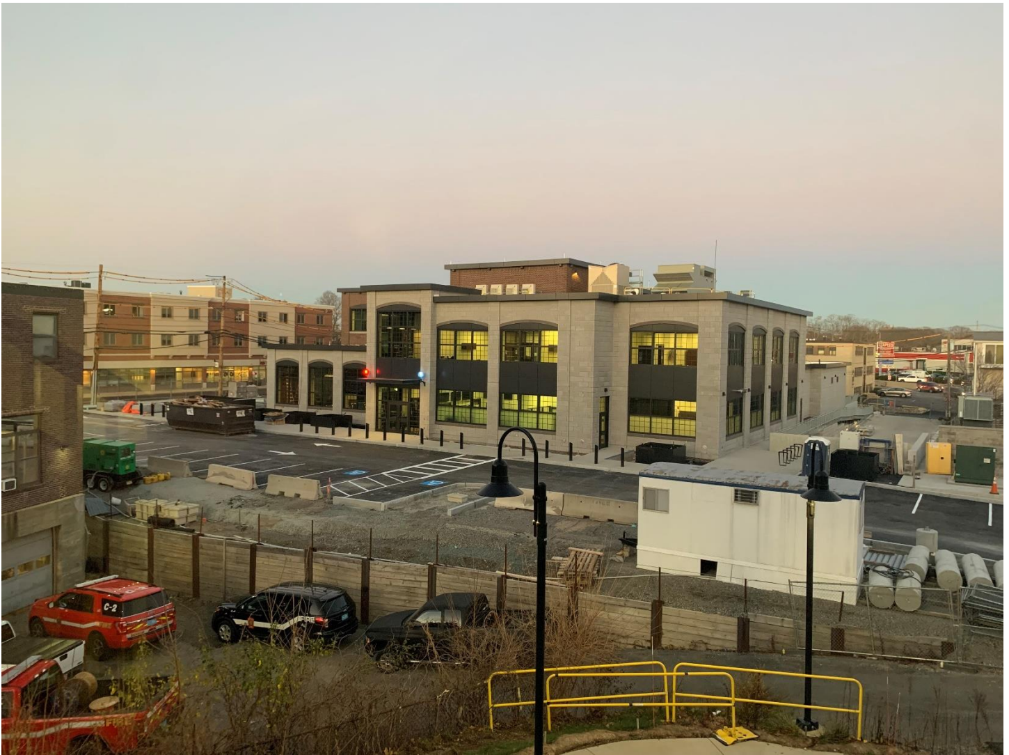
Caption: Photo of the active construction site taken from the north side of Town Hall on Friday, December 9, 2022.

Note: To subscribe to the Public Safety Building Project e-mail notifications, use this link to enter you email address, and select “Public Safety Building” from the list of options.