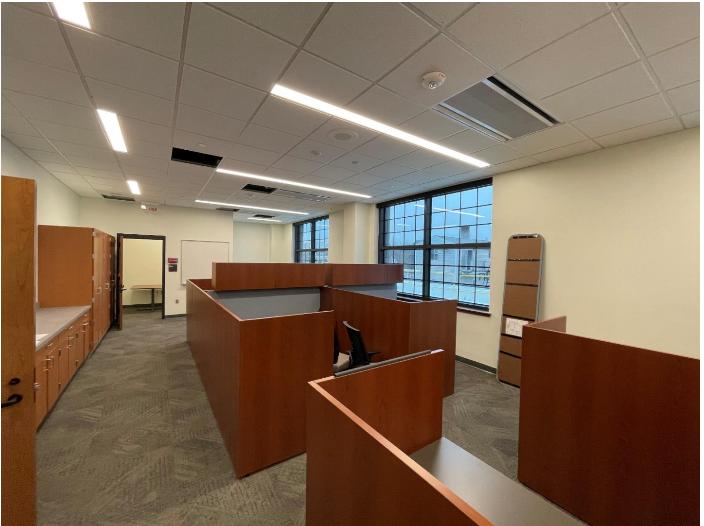
Caption: Photo of new desks and workspaces currently being installed, taken on Wednesday, December 7, 2022.

Note: To subscribe to the Public Safety Building Project e-mail notifications, use this link to enter you email address, and select “Public Safety Building” from the list of options.