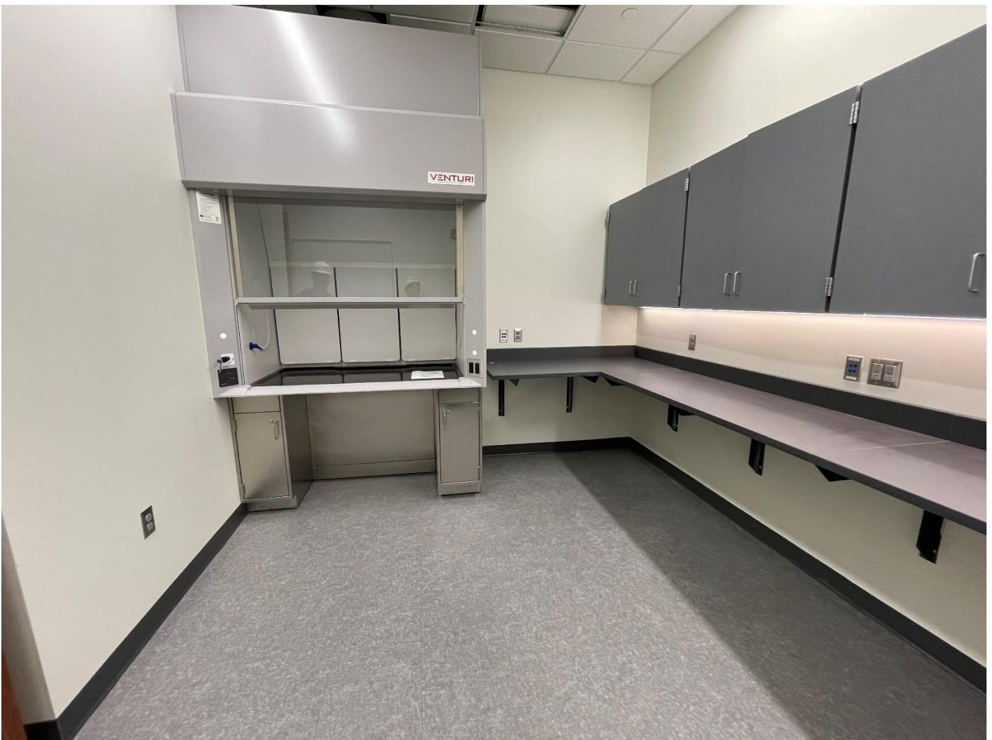
Caption: Photo of the new crime lab under construction within the Police Department, taken on Wednesday, December 7, 2022.

Note: To subscribe to the Public Safety Building Project e-mail notifications, use this link to enter you email address, and select "Public Safety Building" from the list of options.