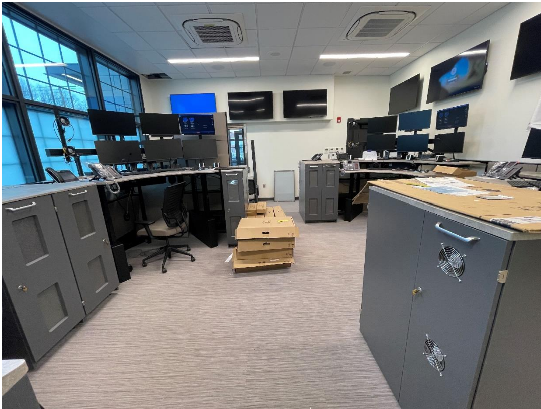
Caption: New Dispatch Area and workspaces, equipped with wall-mounted screens and multiple monitors per station, taken on Wednesday, January 25, 2023.

Note: To subscribe to the Public Safety Building Project e-mail notifications, use this link to enter your email address, and select “Public Safety Building” from the list of options.