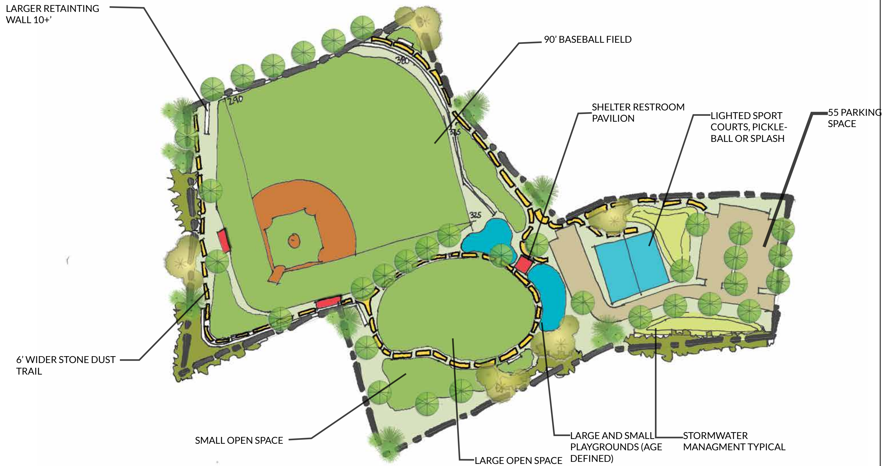
Figure H2 Example of Concept Master Plan for Former Dedham Landfill